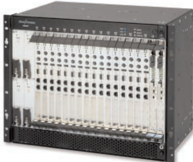
The C0818D features our fail-safe OptiCool™ design, CPCI boards not included with chassis.